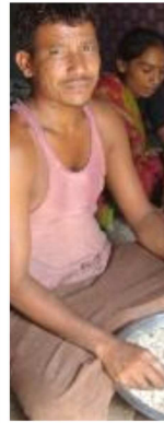
Garlic Peeling, Gujarat