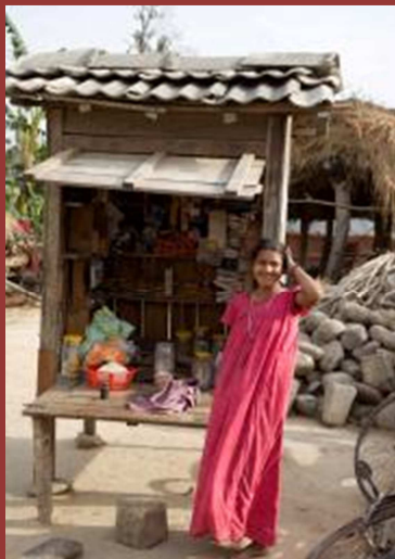
Microfinance at work, BASE, West Nepal

We are pleased that SAATH's concept for a Livelihood Construction Training Centre, based on Shivia's Livelihood Model, has been finalised. The centre will teach five skills-based livelihood enterprises that can be undertaken in the slums: plumbing, tile-laying, carpentry, masonry and electric fitting. As with the microfinance work, funds for the Training Centre will have to be on a grant rather than interest-free loan basis. We plan to learn as much as possible from the centre with the view to replicate it through our own operations in the slums of Kolkata.