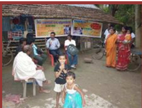
Exposure Visit, Poultry Programme, West Bengal

There have been recent changes to Gujarati regulation meaning that Shivia will have to convert its interest-free loan into a revolving grant for the microfinance work at SAATH.