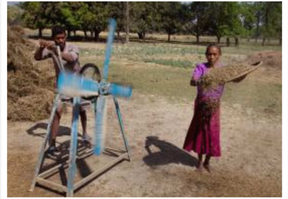
Grain sifting, West Nepal