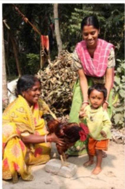
Poultry Development Services